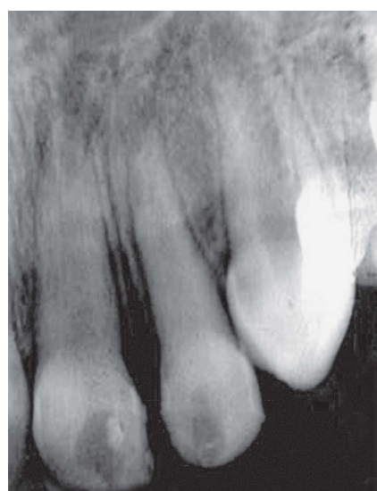
Figure 2. First endodontic treatment session. Calcium hydroxide used as intra-canal dressing.