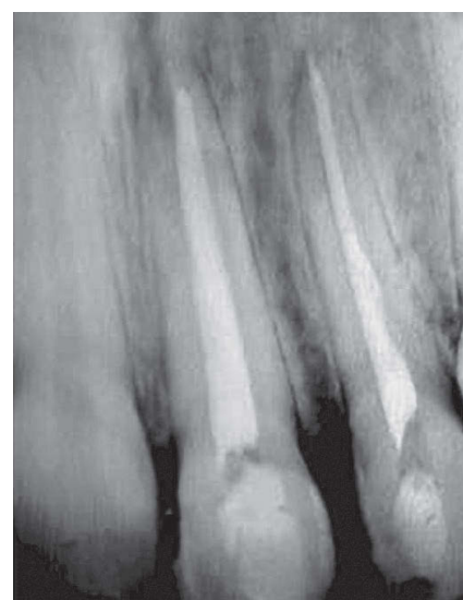
Figure 4. 10-year follow-up.