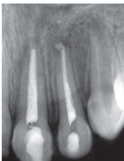
Figure 3. Filled root canal.