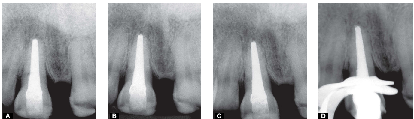
Figure 2. Periapical radiographs of the upper right central incisor. A) Radiographic exam at the fifth appointment, in the end of the treatment, consisting of careful biomechanical preparation and change of intracanal dressing with calcium hydroxide paste and iodoform. B) Radiographic exam at the sixth appointment, in the end of the treatment, consisting of careful biomechanical preparation and change of intracanal dressing with calcium hydroxide paste and iodoform. C) Radiographic exam at the seventh appointment, in the end of the treatment, consisting of careful biomechanical preparation and change of intracanal dressing with calcium hydroxide paste and iodoform, note the apical closure. D) Radiograph proving obturation by lateral condensation technique and Sealapex, in the eighth appointment.

a periapical radiograph was performed to proof length (cone test). A signal was made on the cone with clinical tweezers marking the reference point. After cone test, the sealer was prepared from a portion of homogenized base paste with a portion of the catalyst paste on a glass plate sterilized. The cone was smeared with sealer and settled in the root canal. The length was observed by the coincidence of the mark on the cone with the reference point. Spacing was initially carried out with spacers A30 (Maillefer Instruments, Switzerland)