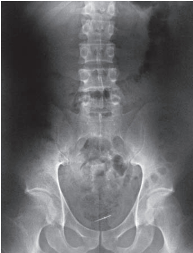
Figure 6. Abdominal X-ray, S1 file in the rectum.