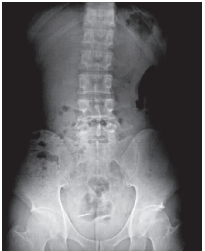
Figure 5. Abdominal X-ray, S1 file in the pubis.