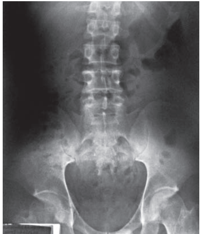
Figure 3. Abdominal X-ray in the large intestine descending colon.

was to perform radiographic monitoring every 12 hours, without food restrictions, discarding the need for hospitalization. After 15 hours the instrument was in the large intestine descending colon (Fig 3). Radiographs of the 2 subsequent days showed that the instrument was located in the pubis and rectum, respectively (Figs 4 and 5). The foreign body was expelled naturally by the patient 72 hours after the last radiography, and he did not want to do other radiography to confirm the file elimination.