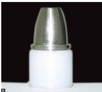
Figure 1 - A) Upper view, B) Lateral view of the new developed tip.