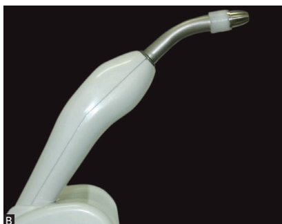
Figure 2 - A) Halogen light curing unit with coupled tip; B) LED curing unit with coupled tip.