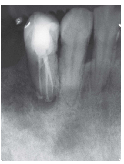
Figure 3. Postoperative radiograph of the root canal obturation.

a disproportional number of flare-ups and endodontic failures.<sup>5</sup> Anatomic variations can result in inadequate debridement which may leave irritants within the canal system and produce an unfavorable environment for healing periapical tissues.<sup>4</sup>