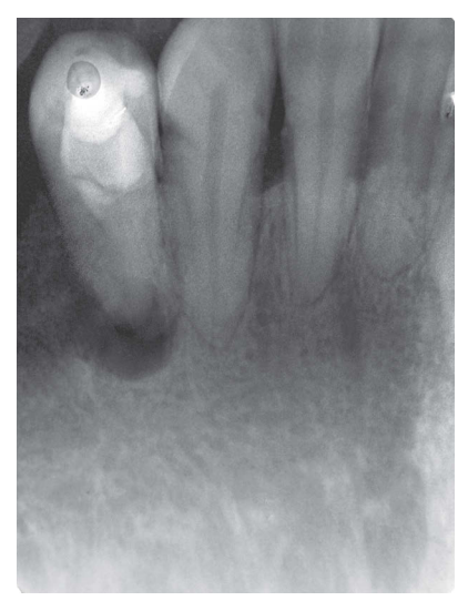
Figure 1. Preoperative radiograph of mandibular first premolar.