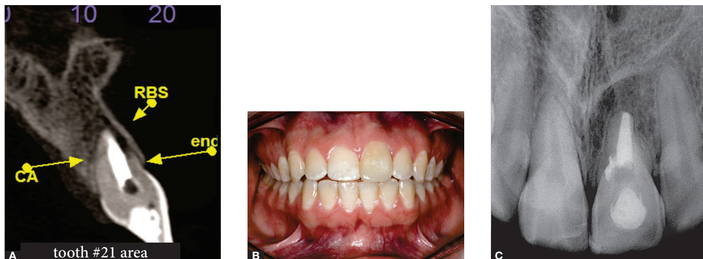
Figure 3. A) Follow-up tomography, after 7 years of treatment beginning. B) Photograph showing mild crown darkening, cervical gingival recession and healthy periodontium. C) Follow-up radiograph, after 7 years of treatment beginning, evidencing the presence of periapical repair, with continuous lamina dura.