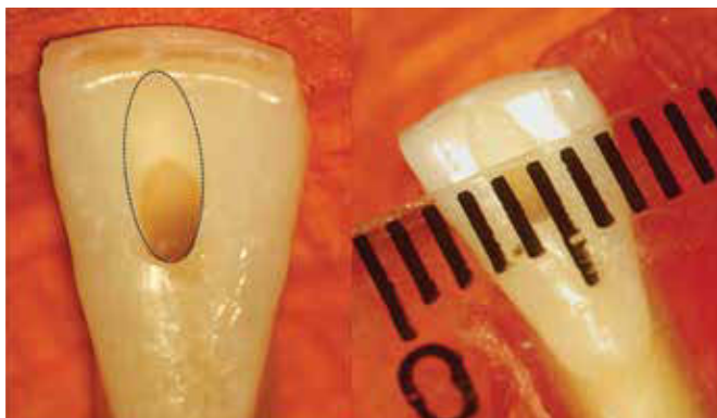
Figure 2. Conservative oval opening.

Table 2 shows that the examiner 1 obtained 15 scores and 11 errors on the localization of the canals on the same teeth on the two shapes of opening (oval and triangular). However, with the six errors occurred on the examination of the teeth with conservative openings, it occurred scores when they were examined after enlarging the cavity. To compare the results obtained by examiner 1, it was used McNemar test, obtaining a p value