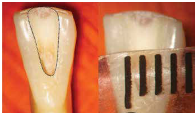
Figure 3. Non-conservative triangular opening.