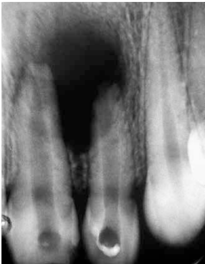
Figure 1. Initial radiograph showing incomplete root formation, extensive radiolucent periapical and root resorption.