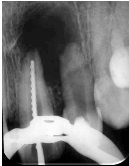
Figure 2. Tooth 21 odontometry for confirmation of the working length.