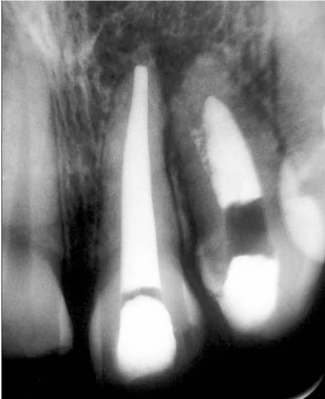
Figure 7. Final root canal fillings after one year and two months of the beginning of the endodontic treatment.