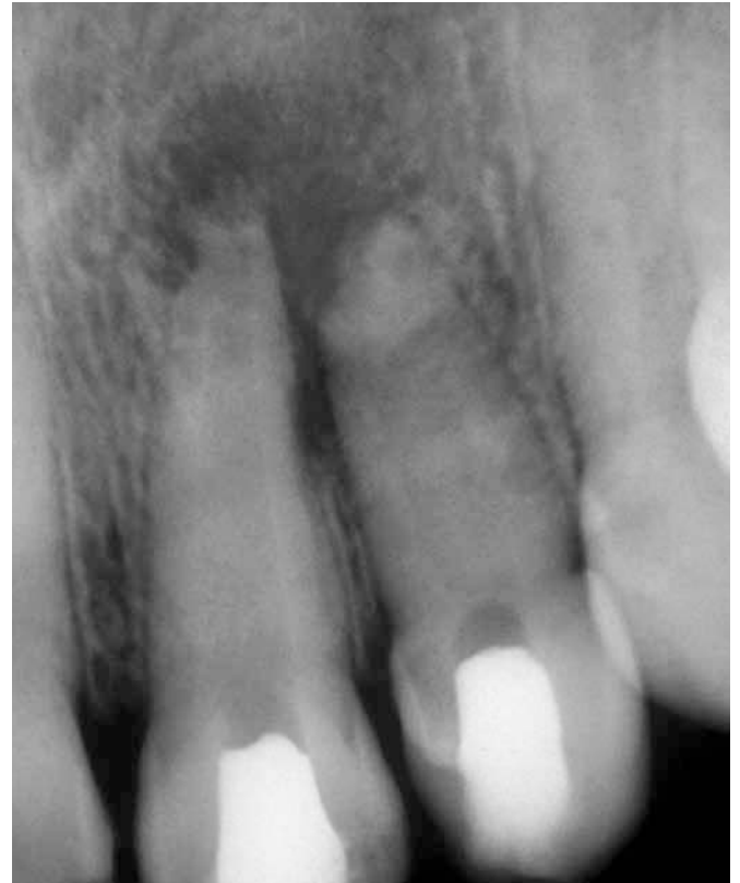
Figure 4. Teeth with intracanal dressing after a period of nine months, showing regression of the periapical lesion, stabilization of the beginning of resorptions and root closure.

After three years of completion of treatment the patient was called for the first radiographic control, when radiographically it was observed repair of the periapical lesion with absence of root formation and root resorption. In element 21 in the third apical was possible to observe slight thickening of the periodontal ligament (Fig 8).