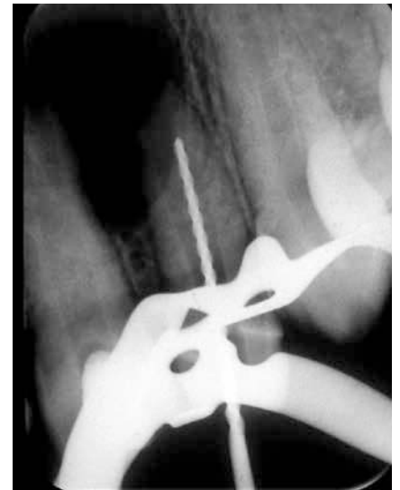
Figure 3. Tooth 22 Odontometry for confirmation of the working length.

of EDTA, another drying was carried out. Calcium hydroxide paste P. A with propyleneglycol was inserted into the root canal, which is replaced when it appeared radiographically that the intra-canal medication had been partially resorbed. This was done to induce apicification or formation of a barrier mineralized in the apical foramen, as well as stabilization of root resorption. After four exchanges of intracanal dressing over a period of nine months, regression of the periapical lesion was observed radiographically, stabilization of resorptions and root closure (Fig 4).