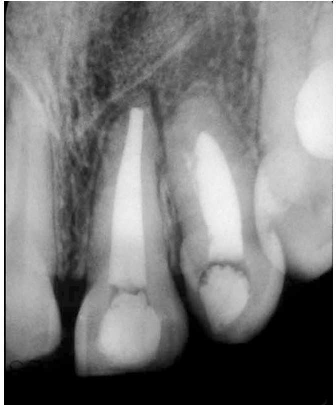
Figure 8. Radiography of preservation after three years of root canal filling showing periapical lesion repair and absence of root formation and root resorption.